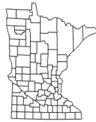
UTM Zone 15 North